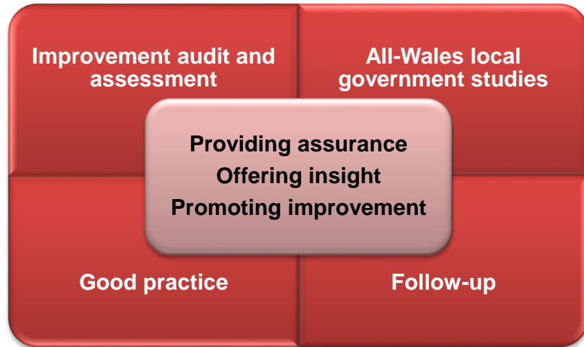
Exhibit 3: Components of my performance audit work